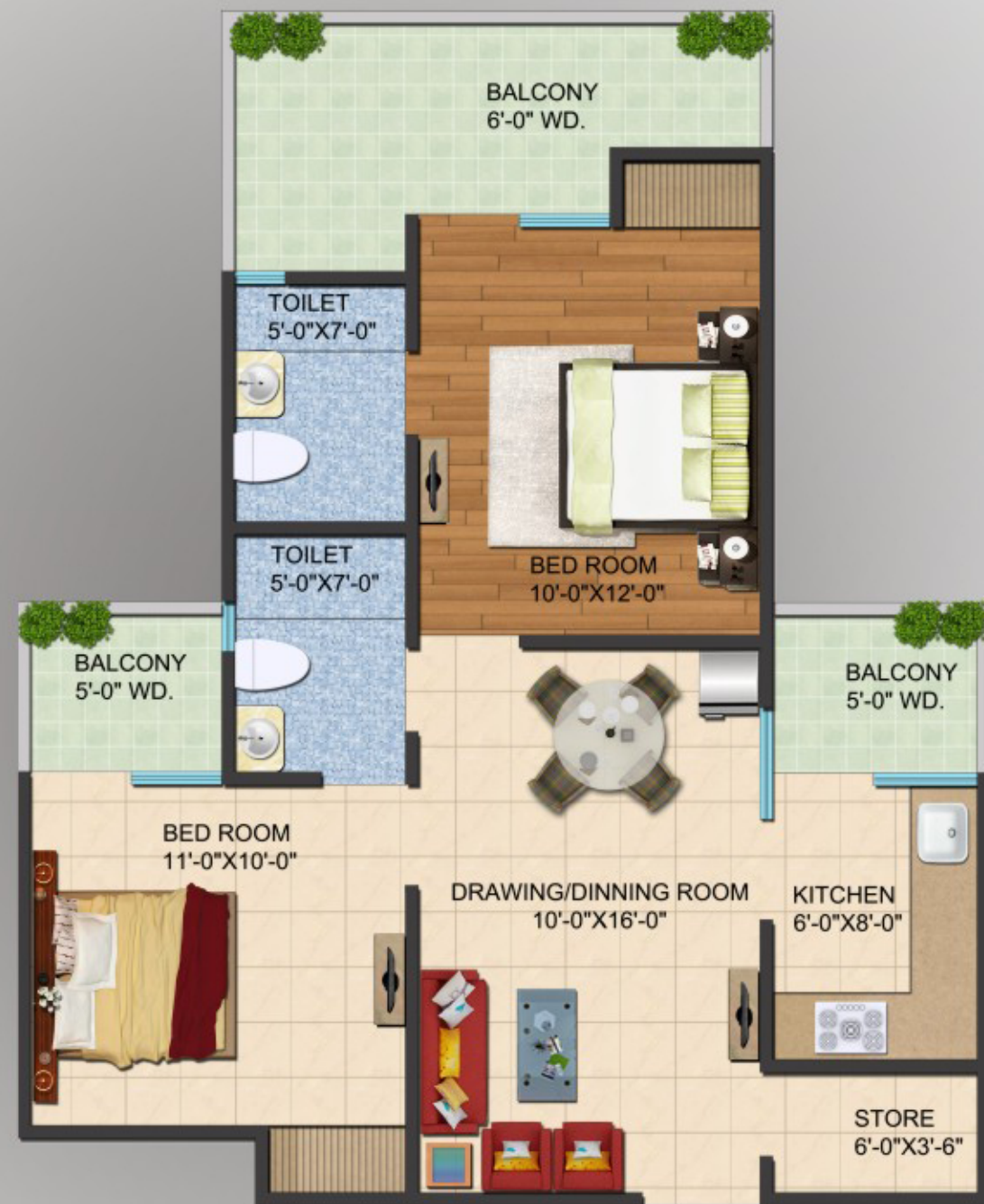
MIG-1 : 2 BHK+2 Toilet+store • Super Area = 995.00 Sq. Ft. Drawing | Dining | 2 Bedrooms | 2 Toilets | Kitchen | Store | 3 Balconies