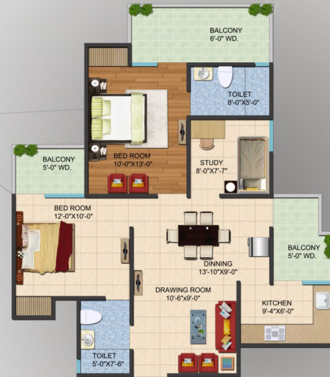
MIG-2 : 2 BHK + 2 Toilet+Study • Super Area = 1195.00 Sq. Ft. Drawing | Dining | 2 Bedrooms | Study Room | Kitchen | 2 Toilets | 3 Balconies